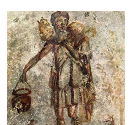
THE GOOD SHEPHERD