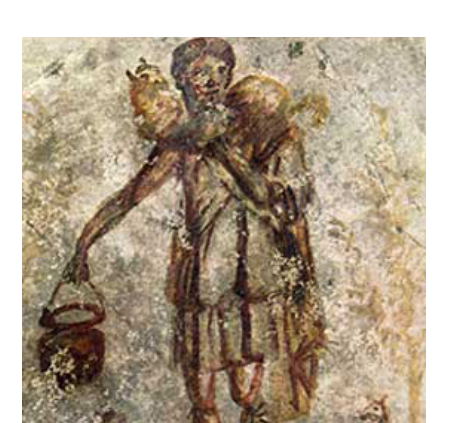
THE GOOD SHEPHERD