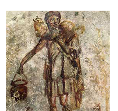
THE GOOD SHEPHERD