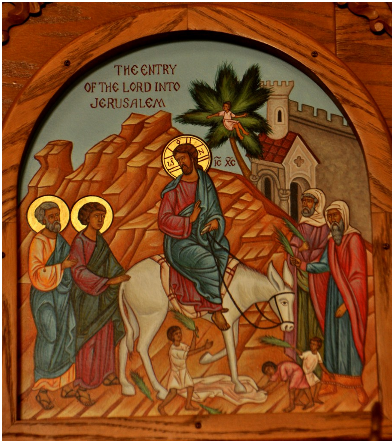
"Palm Sunday Icon"

threat to the current king's throne! Therefore, Jerusalem is not a safe place for Jesus and His disciples. Despite knowing the danger, Jesus voluntarily enters Jerusalem because He is not just there to save the people of that time, but will be crucified and Resurrect for the salvation of every single person, ever.