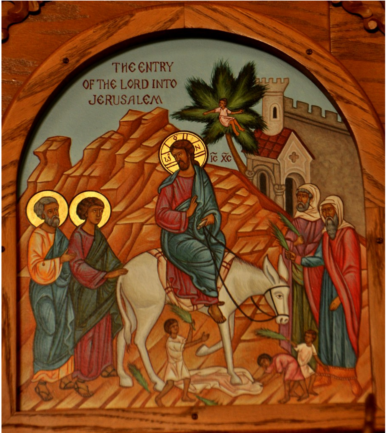
"Palm Sunday Icon" by bobosh_t is marked with CC BY-SA 2.0 .