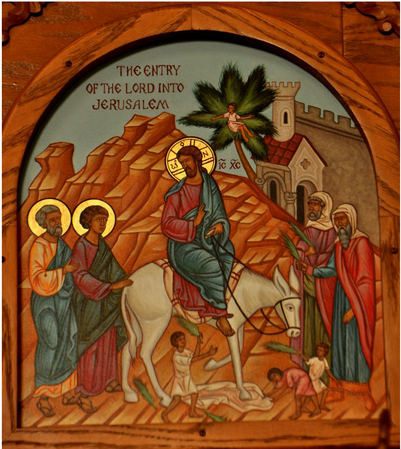
"Palm Sunday Icon"

His disciples. Despite knowing the danger, Jesus voluntarily enters Jerusalem because He is not just there to save the people of that time, but will be crucified and Resurrect for the salvation of every single person, ever.