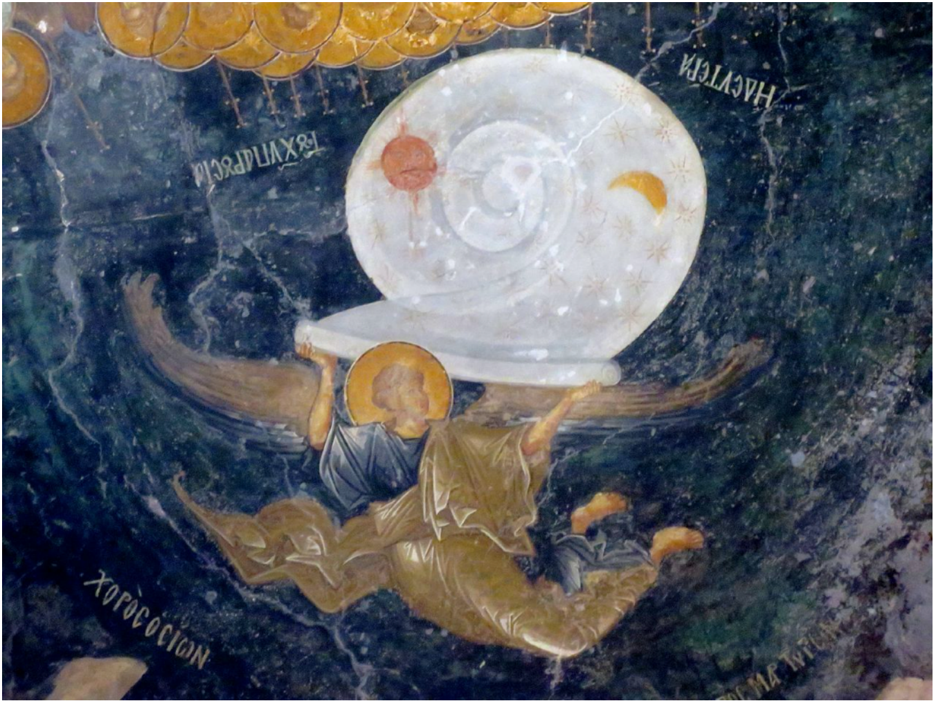
This icon is in the Church of Chora in Istanbul, Turkey.

“All the stars in the sky will be dissolved and the heavens rolled up like a scroll.”