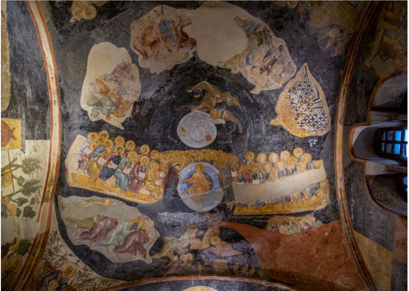
This icon is in the Church of Chora in Istanbul, Turkey.