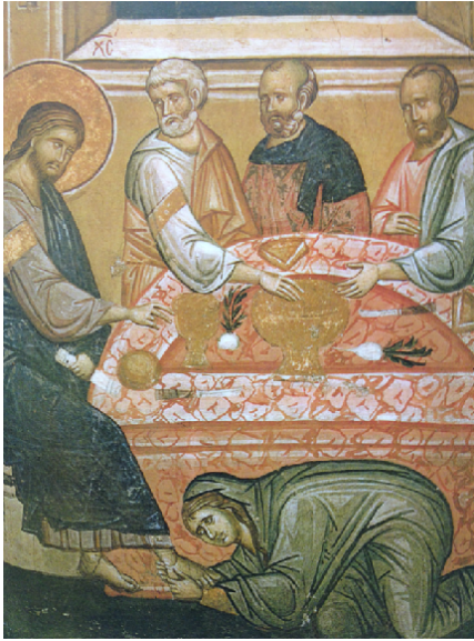
Mary, Sister of Lazarus, anointing Jesus in Bethany while Jesus is having dinner with His Disciples