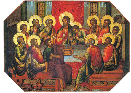
Mystical Supper - first Holy Communion and when Jesus predicts Peter will deny Him 3 times