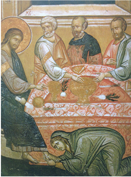
Mary, Sister of Lazarus, anointing Jesus in Bethany while Jesus is having dinner with His Disciples