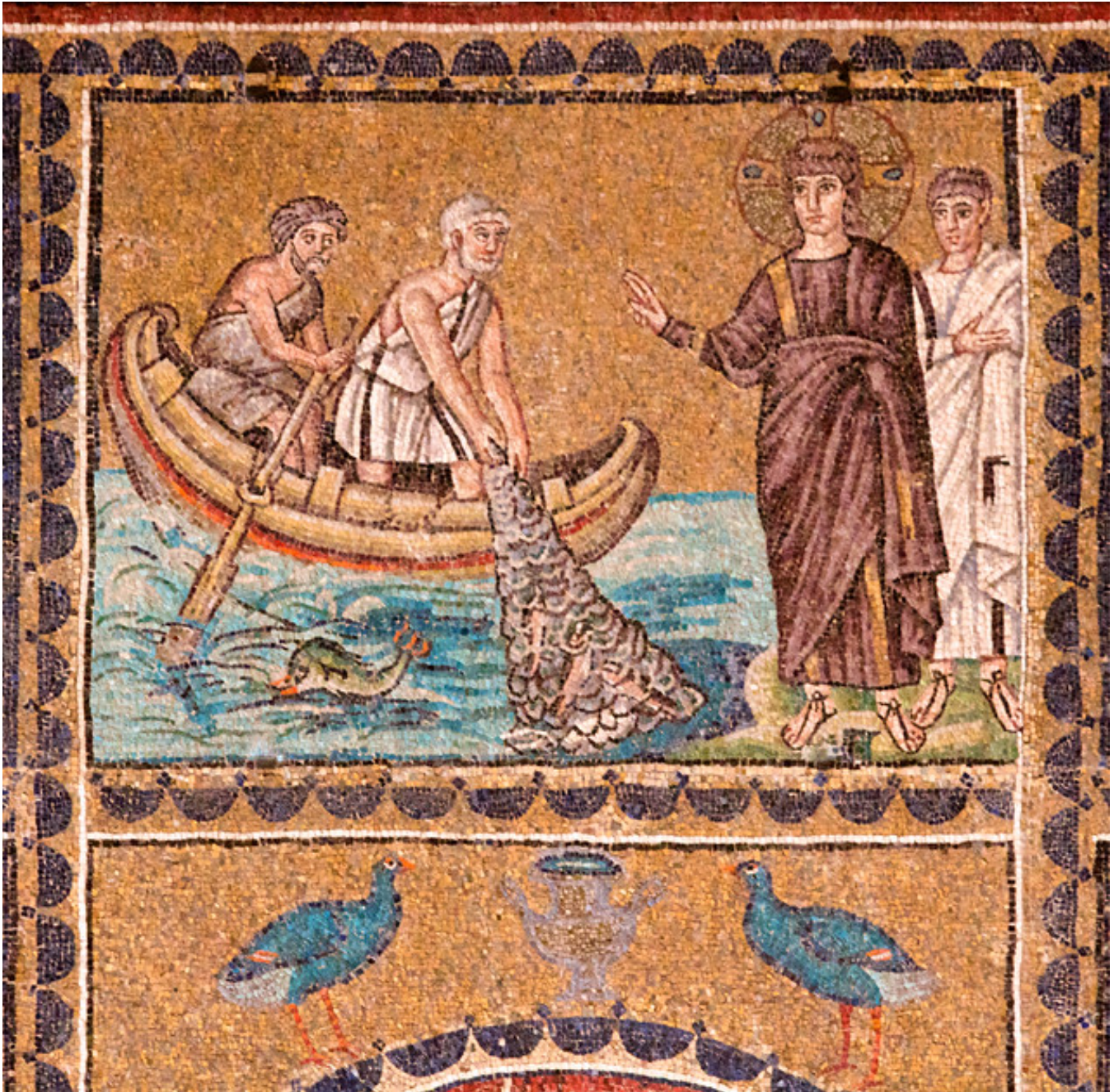
Sant'Apollinare Nuovo, Ravenna, Italy

Saints Peter and Andrew were brothers and the first two Disciples of Jesus.