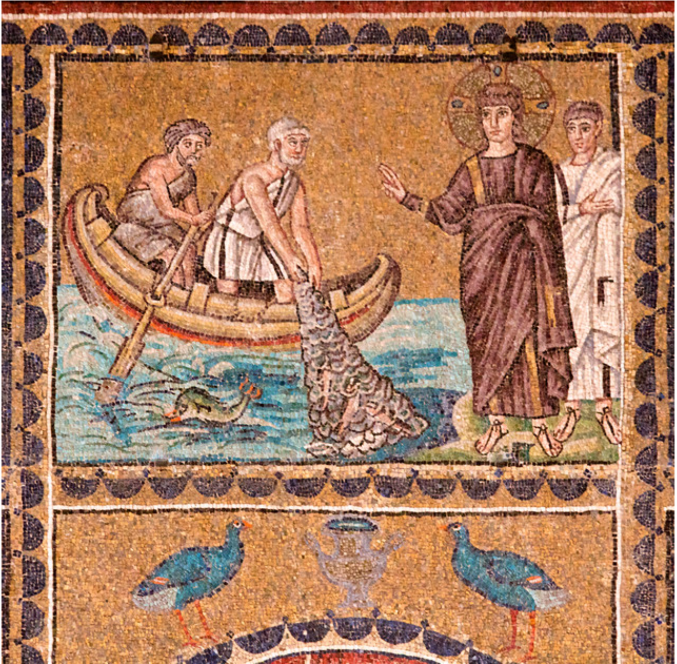
Sant'Apollinare Nuovo, Ravenna, Italy

Saints Peter and Andrew were brothers and the first two Disciples of Jesus.