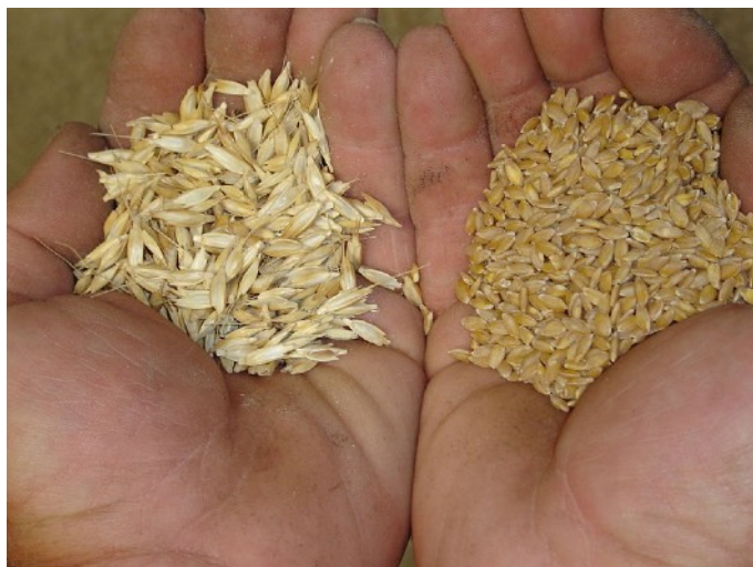
(Left) Chaff; (Right) Wheat

How can I tell the difference between the wheat and the chaff? The wheat is the small seed that grows at the tip of the wheat grass plant. This seed will provide new life to another wheat plant. The chaff is the outer, inedible hull of the wheat kernel. The chaff is papery-thin and will easily blow away.