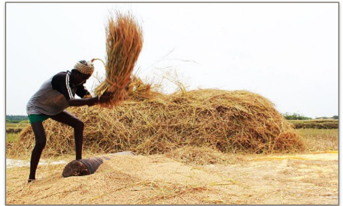
Threshing grains

Wheat is what we use to make bread and it grows as a tall grass. When the wheat is harvested, there is much work still to be done before you get the wheat kernels or berries that you will use to grind to make flour.