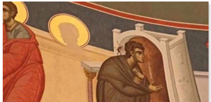
"Then Satan entered Judas, surnamed Iscariot, who was numbered among the twelve. So he went his way and conferred with the chief priests and captains, how he might betray Him to them. And they were glad, and agreed to give him money." Luke 22:3-5

For the Passover meal, there were many rules associated with its preparation. For instance, Peter and John would have to bring the sacrificial lamb back to the house from the Temple where it would be specially prepared for Jesus and His disciples. Additionally, the meal needed to be eaten within the city limits of Jerusalem, which necessitated a level of secrecy when arranging for a place for their meal. Jesus was going to be betrayed and arrested. It was just a matter of when would Jesus allow it to happen.