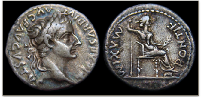
Denarius of the Emperor Tiberius shown to Jesus

But...that’s not how it worked out. Jesus responds to them in the most unexpected way. First, He harshly reprimands them for trying to maliciously trap Him like that. Then He reveals His divine wisdom.