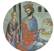
Pontius Pilate: Governor of Judea at the time of Jesus