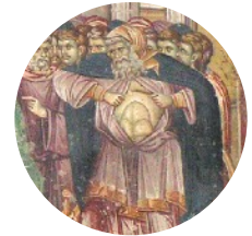
Caiaphas: High priest at the time of Jesu