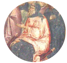
Annas: Father-in-law of Caiaphas

After Jesus was arrested, He was taken to the home of the high priest, Caiaphas. Jesus was questioned first by Annas, Caiaphas' father-in-law, and then interrogated by Caiaphas. They were looking for anything Jesus might say that would incriminate Himself. Under Roman rule, the Jews were allowed to hold their own trials, decide how to punish someone, and then carry it out - except the death penalty. If they wanted the death penalty, and they did in this case,